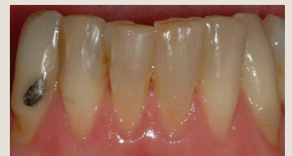
Examples of silver fillings